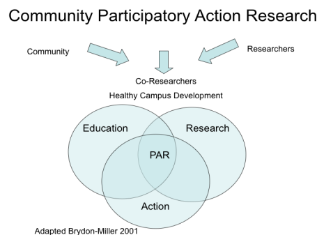
Figure 2. The collaborative CBPAR design to promote engagement across sectors.

CBPAR encompasses research, education and action in addition to involving an ongoing process of methodological refinement (Minkler & Wallerstein 2003). The design evolves through negotiation and dialogue between researchers and community members, who function as co-researchers, in an egalitarian team (see Figure 2). CBPAR complements and strengthens the action strategies of setting-based health promotion, enabling the research team to explore changing determinants of health and interactions in communities more thoroughly (Satcher 2005).